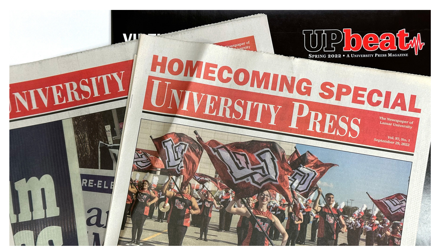
UP offering print edition during Cardinal View on March 4

So, I cemented my legacy by being the "If she can do it so can you" girl. But that's fine. Playing the tuba is an experience that once seemed unimaginable, but eventually became unforgettable.